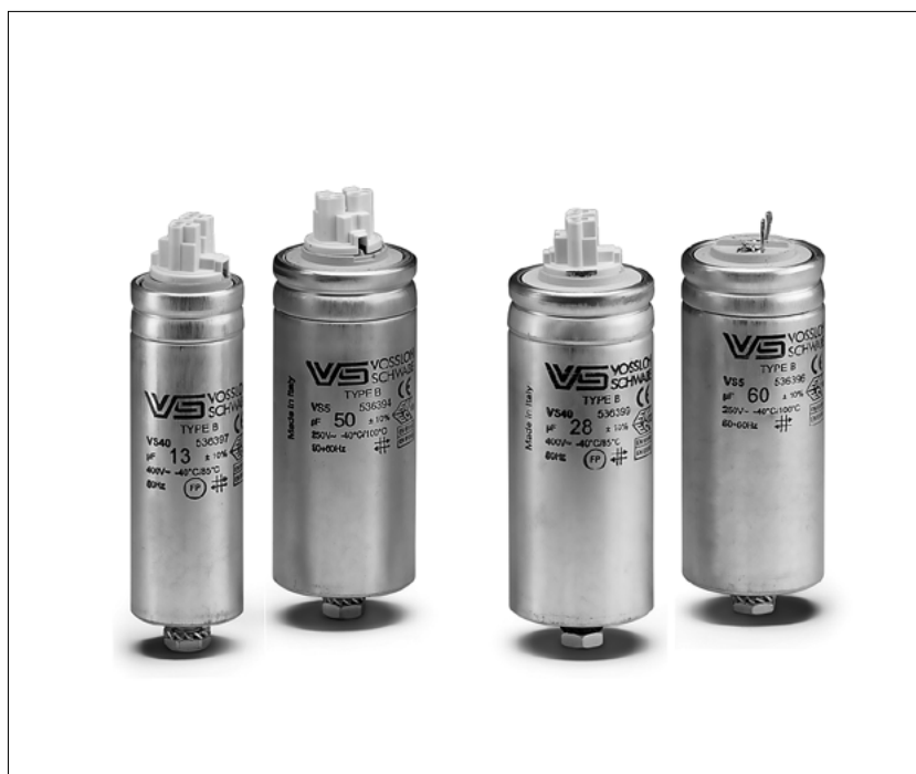
A Push-in twin terminals 0.5–1 mm 2

On request further capacities or connectors