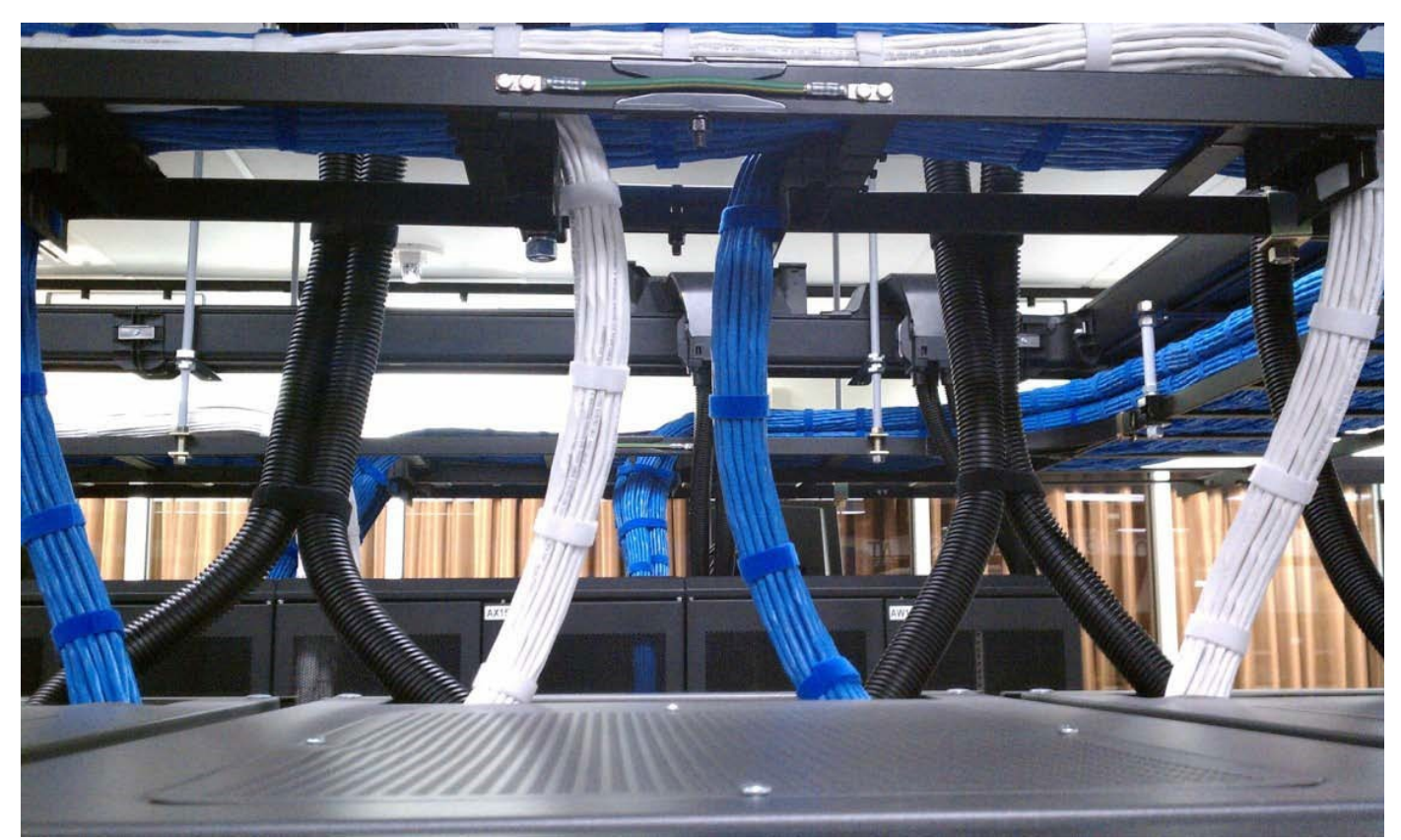
Figure 1. Color-Coded Server Cabinet Cabling Bundles in Panduit World Headquarters

Figure 1 shows color-coded copper cabling bundles leading from server cabinets. In many installations, the cabinet will contain in excess of 40, one RU profile servers. The server-to-switch connections are very often configured for two separate connections, referred to as primary and secondary connections (alternatively main and redundant). In this example, cables associated with the main connection are color-coded blue, and those for the redundant connection are white. Adherence to good labeling practices in the vicinity of the connections to equipment is followed to aid identification of specific cables at a later time. Color-coded hook and loop ties neatly support cable bundles without pinching and potential performance degradations associated with often used nylon cable ties. These cables will be connected to the patching fields for the servers within the cabinet.