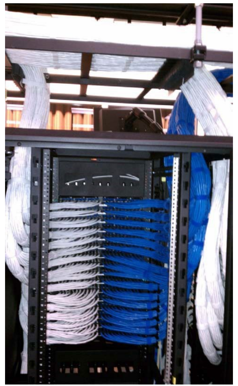
Figure 2. Switch Cabinet Patching Fields

Figure 2 shows the rear view of the patching fields for the switch. 192 cables each in white and blue enter the patching field. Patch cords are used on the reverse side of the cabinet to connect the terminated cables to the switch.