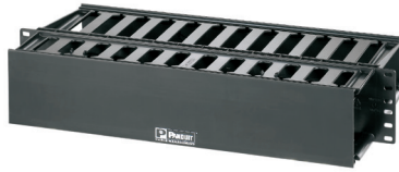
PatchLink™ WMP* Series