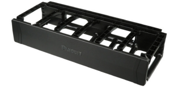
PatchRunner™ 2 PR2HF* Series