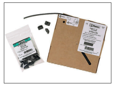
Dura-Ty <sup>™</sup> Kit – Recyclable dispenser pack has through-hole for attaching to belt plus storage area for bag of heads