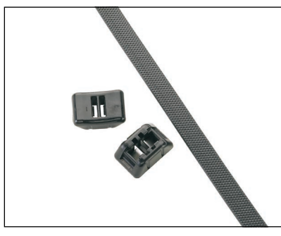
Heavy Cross Section – Textured strap body and robust head design for reliable installations