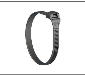
Fully enclosed head for consistent strength and outside teeth for high vibration applications