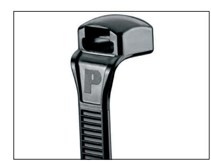
Low profile head for reduced bundle size and smooth, round edges to prevent damage to cable bundles

*Meets testing requirements of SAE Aerospace Standard AS23190 and the dimensional requirements of SAE Aerospace Standards AS33671 and AS33681.