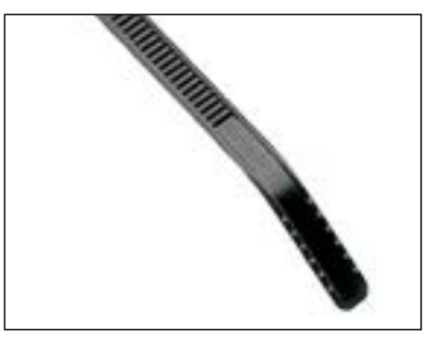
Curved tip and aggressive grip for fast and easy installation