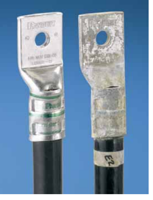
Before and after rigorous NEBS Level 3 testing.

as Bellcore, maintains the NEBS documents. NEBS is the most common set of safety, spatial, and environmental design guidelines applied to telecommunications equipment in the United States.