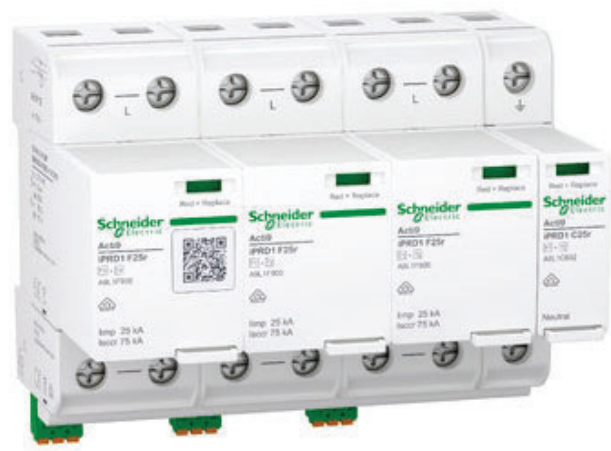
A9L1F625 (3 x A9L1F125 + 1 x A9L1F102)