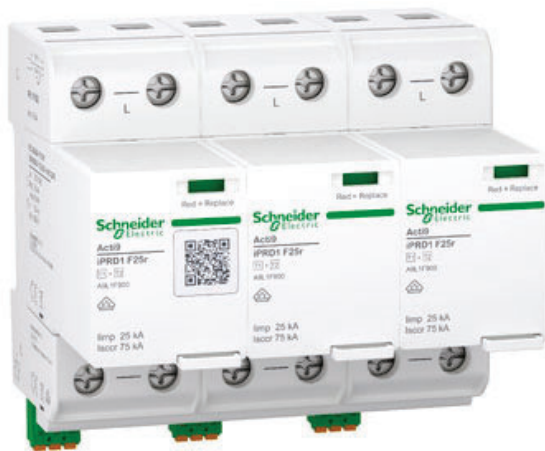
A9L1F325 (3 x A9L1F125)