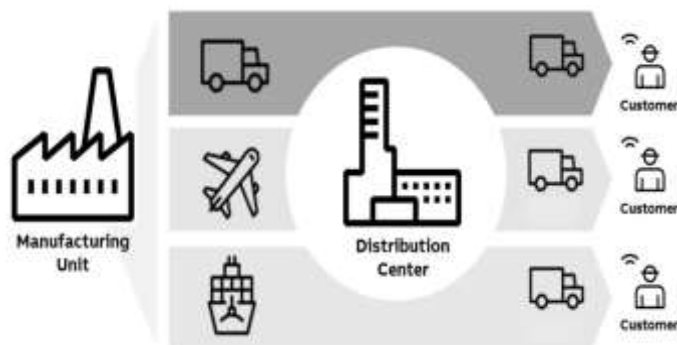
Figure 2: Distribution methodology.

Since no specific data is available for the transport distances from the Distribution Centre to place of actual use (Customer site), distances of 1000 km are assumed (local/domestic transport by lorry, according to PCR [1]).