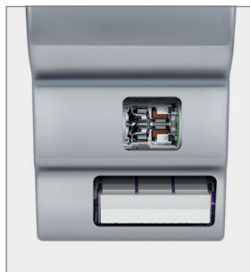
AB02/04/06/14 HEPA Filter SKU#: 925985-02