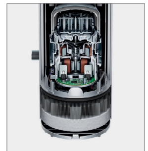
AB09/10/11 HEPA Filter SKU#: 965395-01