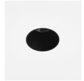
CODE: 1392018 FINISH: MATT BLACK

TO MAINTAIN THIS PRODUCT TO ITS BEST CONDITION, PLEASE VIEW OUR CARE AND CLEANING GUIDE ON THE SUPPORT SECTION OF THE ASTRO WEBSITE.