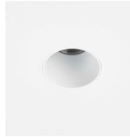
CODE: 1392017 FINISH: MATT WHITE