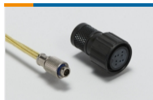
Standard Circular Connectors(519)