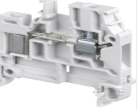
TE Part # 1SNA199557R2600 D2.5/5.ADO