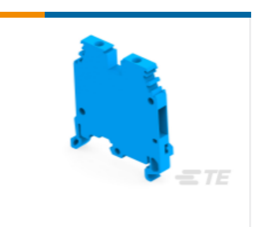
TE Part # 1SNA125486R0500 MA2.5/5.N