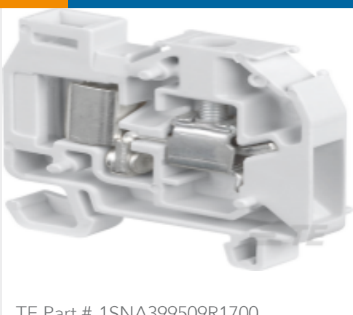
TE Part # 1SNA399509R1700 DR2.5/5.ADO