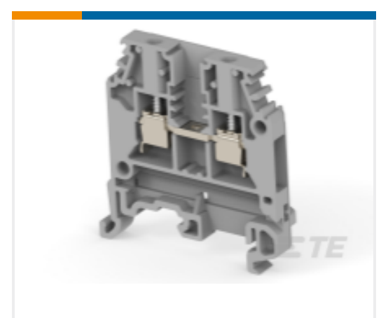
TE Part # 1SNA115485R0200 MA2.5/5.1