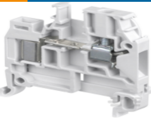
TE Part # 1SNA199556R2500 D2.5/5.N.ADO