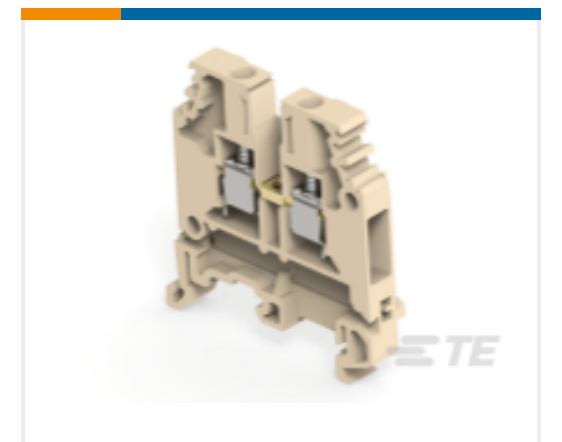
TE Part # 1SNA195486R0400 MA2.5/5