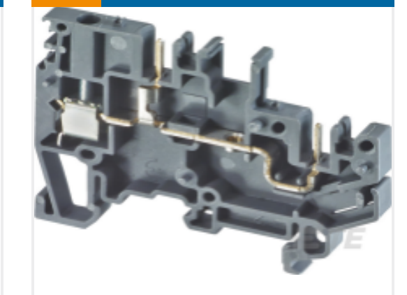
TE Part # 1SNA125711R1500 MA2.5/5-2CPE