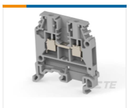
TE Part # 1SNA115486R0300 MA2.5/5