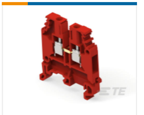
TE Part # 1SNA400184R2700 MA2.5/5