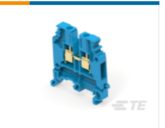
TE Part # 1SNA125485R0400 MA2.5/5.1