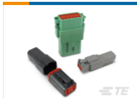
TE Part #DT04-2P DEUTSCH DT Series Housings & Connectors