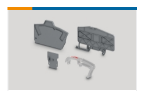
Terminal Block & Strip Insulating Accessories(14)