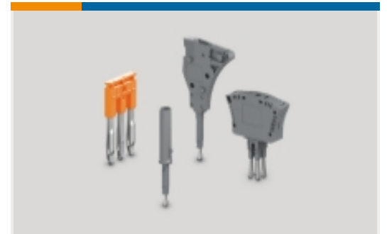
Terminal Block & Strip Conducting Accessories(26)