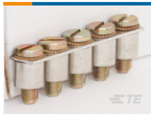
TE Part #1SNA178033R2600 BJD6