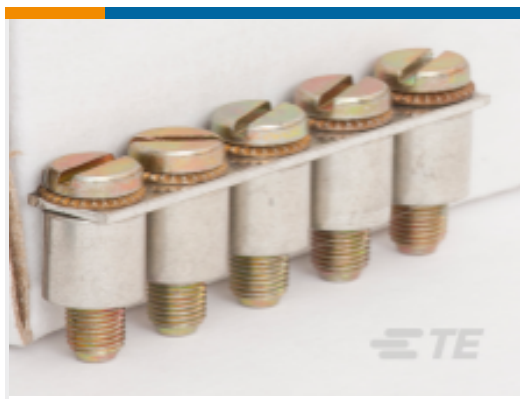
TE Part #1SNA178032R2500 BJD6