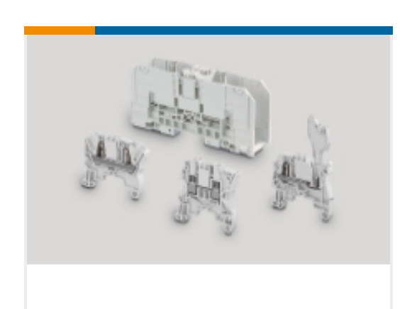
Modular Terminal Blocks(182)