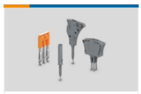
Terminal Block & Strip Conducting Accessories(26)