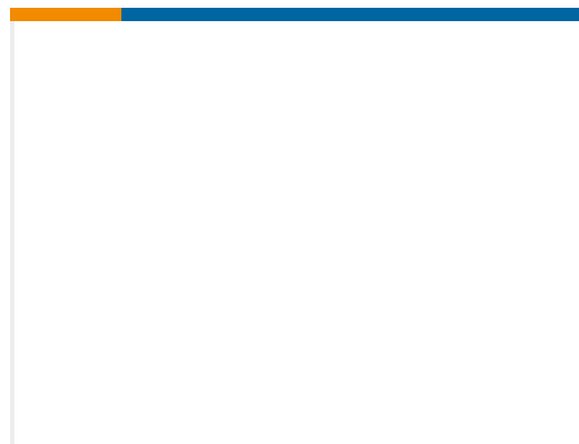
TE Part # 1SNA206394R0200 EV6I