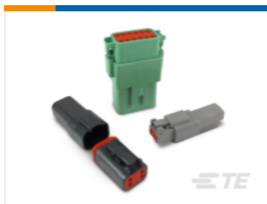
TE Part #DT04-2P DEUTSCH DT Series Housings & Connectors