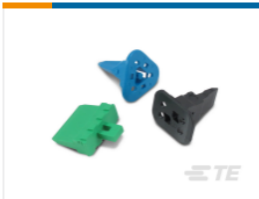
TE Part #W2S DEUTSCH DT Wedgelocks