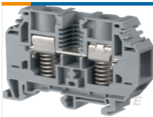
TE Part # 1SNA115320R2700 M10/10.RS