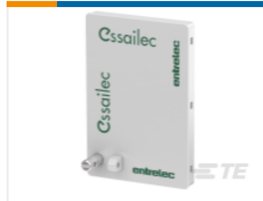
TE Part #1SNA166578R0100 CPC-1