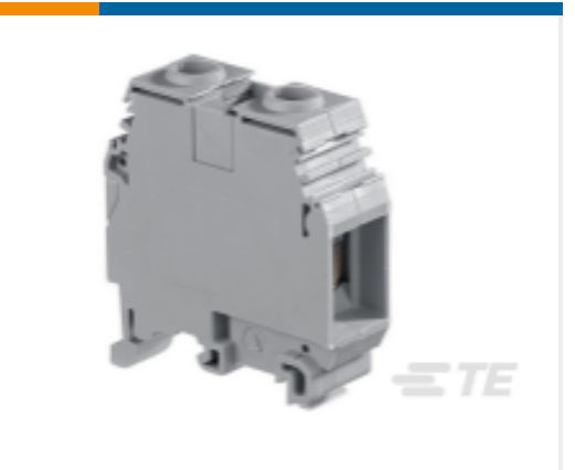
TE Part #1SNA115124R0700 M35/16