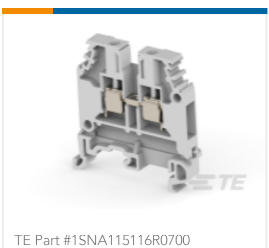
TE Part #1SNA115116R0700 M4/6