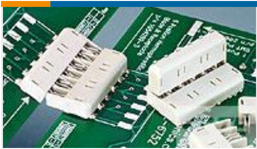
TE Part #1954289-2 Connector, Blade & Recept 4 Pos