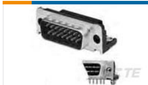
TE Part #5747843-3 37 MSFL PLUG RA 318 (IN,FM,BL)