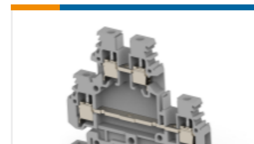
TE Part #1SNA115490R1300 MA2.5/5.D2