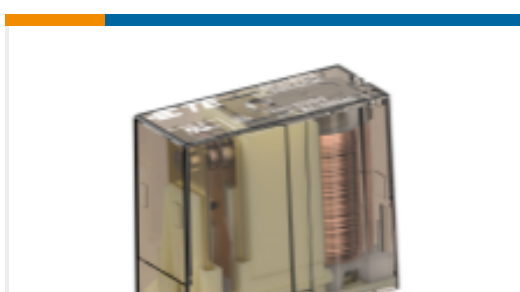
TE Part #8-1415546-7 RP314012