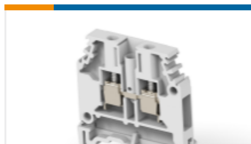
TE Part #1SNA115192R0400 M4/6.4