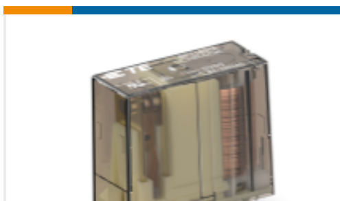
TE Part #9-1415546-9 RP714012