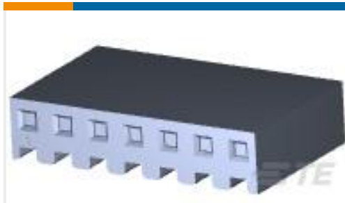
TE Part #640251-7 07P SL156 HSG W/O LCK RAMP