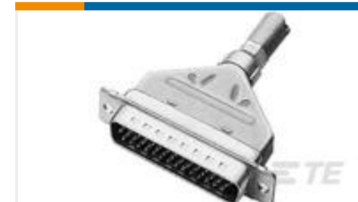
TE Part #1658677-1 HDP-22,OVRMLD,PLUG KIT,SIZE 3,