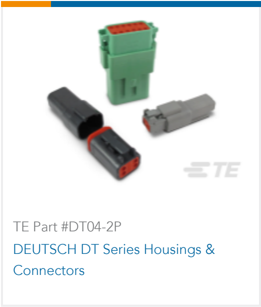
TE Part #DT04-2P DEUTSCH DT Series Housings & Connectors