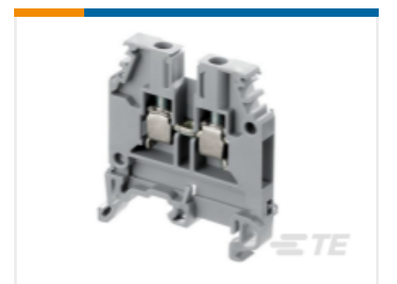
TE Part # 1SNA105032R1500 M4/6