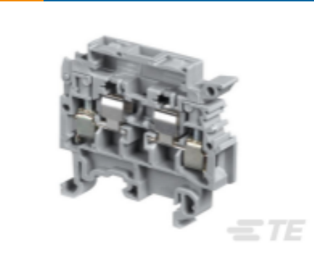
TE Part # 1SNA105135R1100 M4/8.SF2