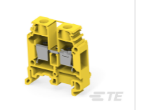
TE Part # 1SNA105120R2600 M10/10