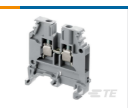
TE Part # 1SNA105116R1600 M4/6