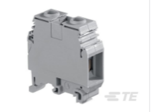
TE Part # 1SNA105124R1600 M35/16