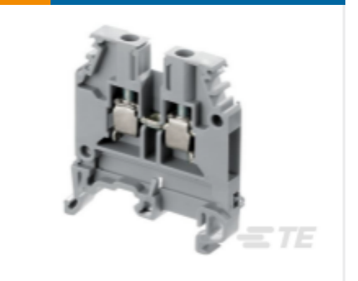
TE Part # 1SNA105075R2000 MA2.5/5