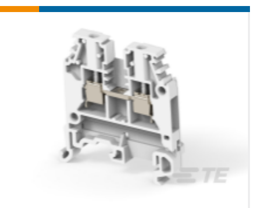
TE Part # 1SNA105052R2100 MA2.5/5