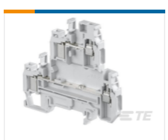
TE Part #1SNA199242R0200 D4/6.D2.ADO

TE Part #1SNA028147R2200 LA300/FUJITSU24/OMN20/173/UL