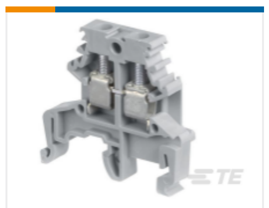
TE Part # 1SNA105265R0300 MS4/6