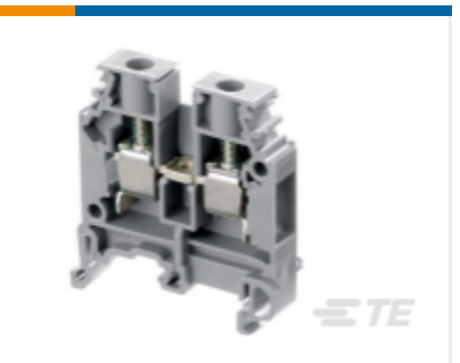
TE Part # 1SNA105128R2200 M6/8.1