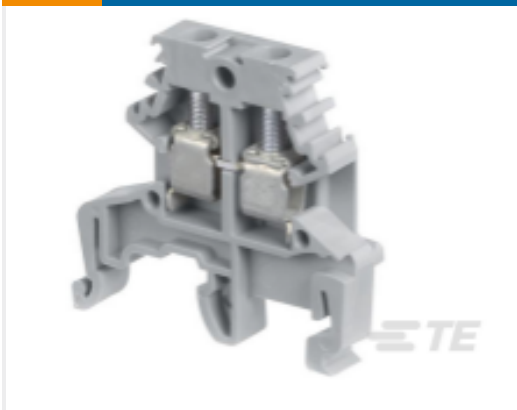
TE Part #1SNA115265R2400 MS4/6