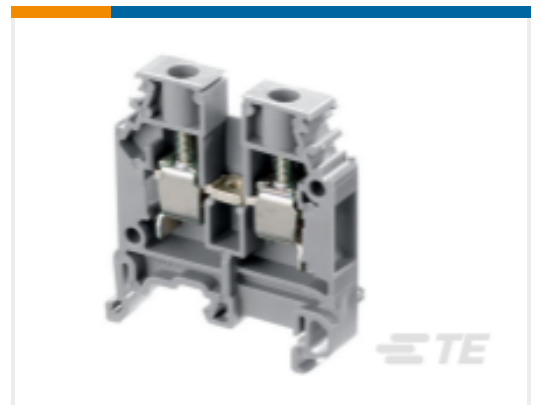
TE Part # 1SNA105118R2000 M6/8