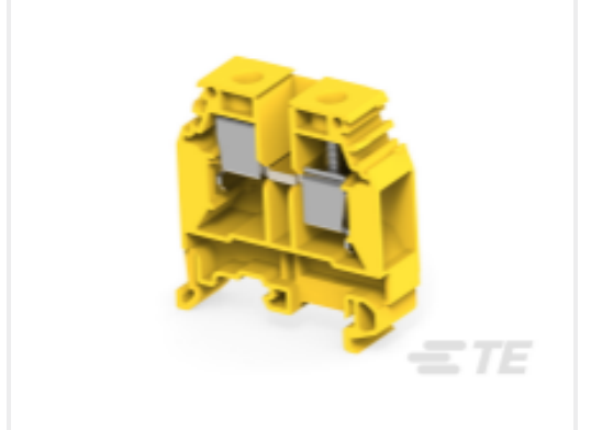
TE Part # 1SNA105129R2300 M16/12