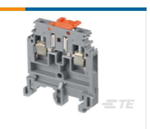
TE Part # 1SNA105053R2200 M4/6.SNB