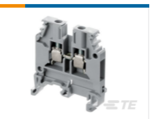
TE Part # 1SNA105077R2200 MA2.5/5