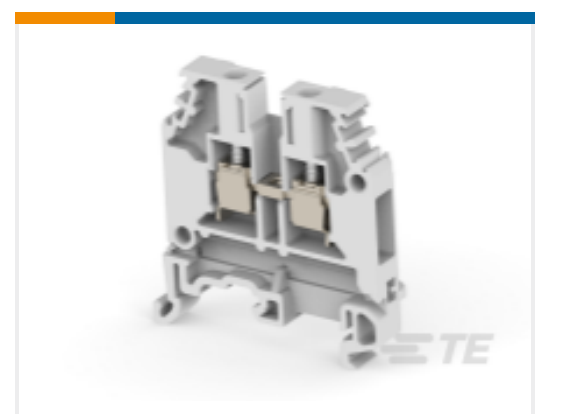
TE Part # 1SNA105051R2000 M4/6