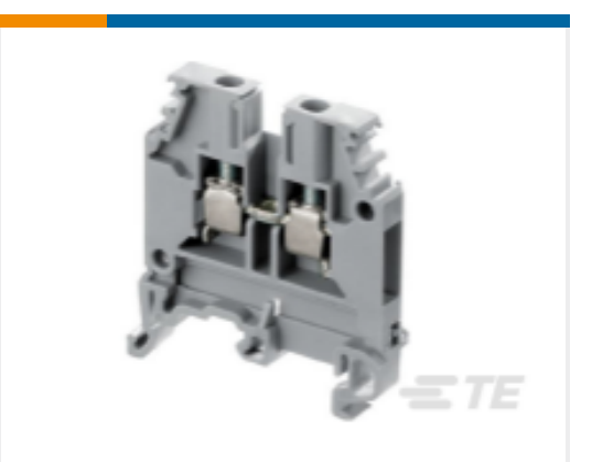
TE Part # 1SNA105209R1400 M4/6