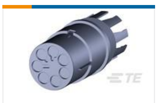
TE Part #293722-1 NECTOR M PIN HSG FREE HANGING 7P CODE A