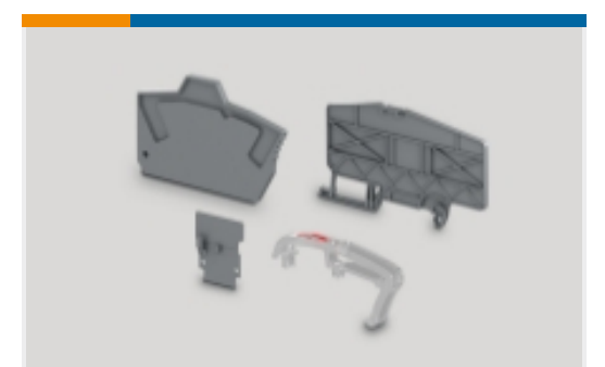
Terminal Block & Strip Insulating Accessories(30)