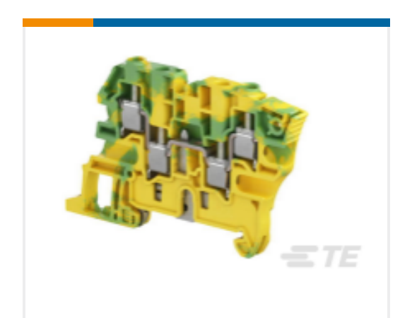
TE Part # 1SNK506152R0000 ZS6-4S-PE