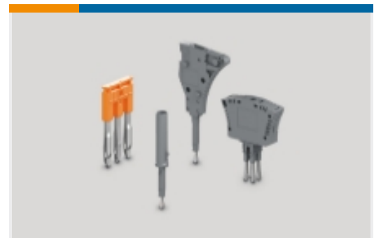
Terminal Block & Strip Conducting Accessories(67)