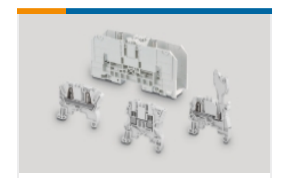
Modular Terminal Blocks(318)