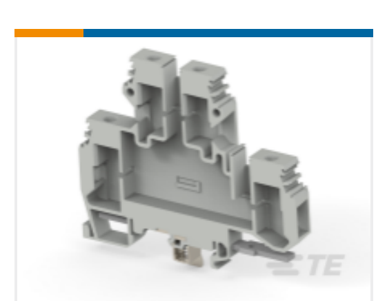
TE Part #1SNA115498R1700 M6/8.D1