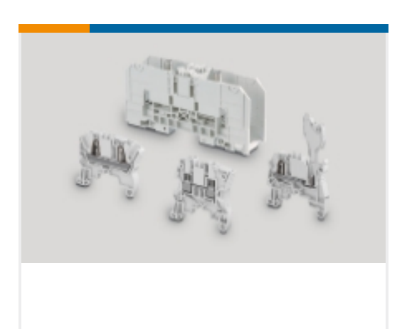
Modular Terminal Blocks(318)