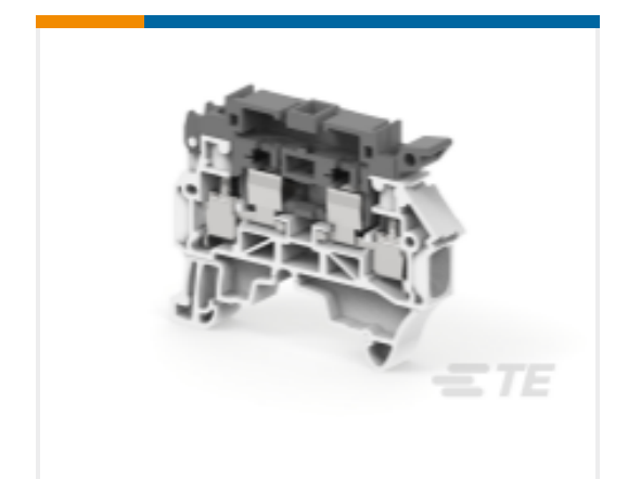
TE Part #1SNK508410R0000 ZS4-SF1