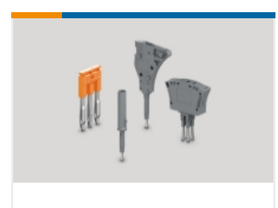
Terminal Block & Strip Conducting Accessories(67)