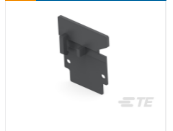
TE Part # 1SNK900101R0000 CS