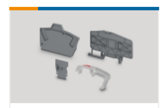
Terminal Block & Strip Insulating Accessories(30)