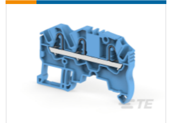
TE Part #1SNK705021R0000 ZK2.5-3P-BL