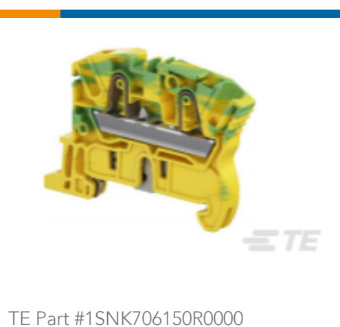
TE Part #1SNK706150R0000 ZK4-PE