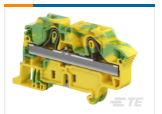
TE Part #1SNK710150R0000 ZK10-PE