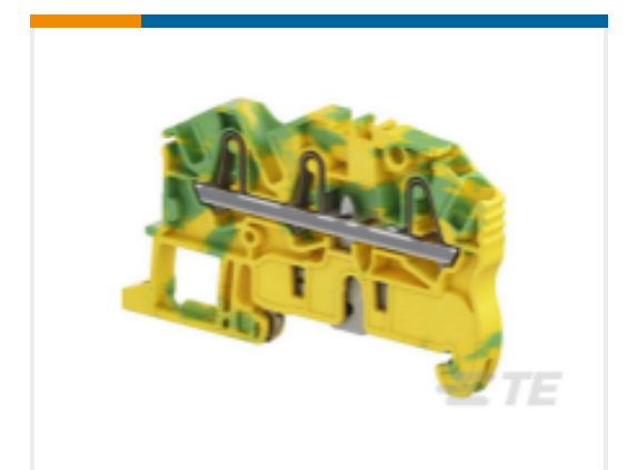
TE Part #1SNK705151R0000 ZK2.5-PE-3P