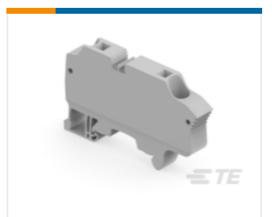
TE Part #1SNK710010R0000 ZK10