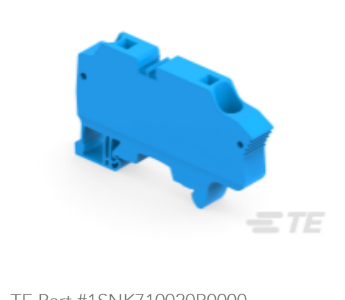
TE Part #1SNK710020R0000 ZK10-BL