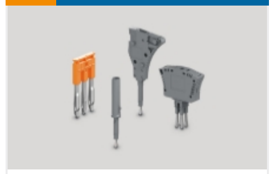
Terminal Block & Strip Conducting Accessories(67)