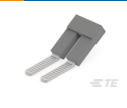
TE Part #1SNA113546R1400 PC6-2