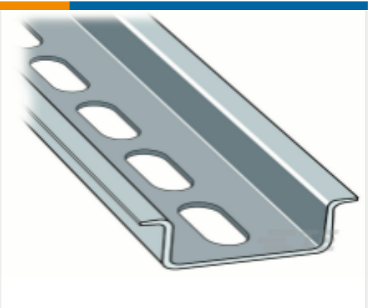
TE Part # 1SNA178529R0400 PR50