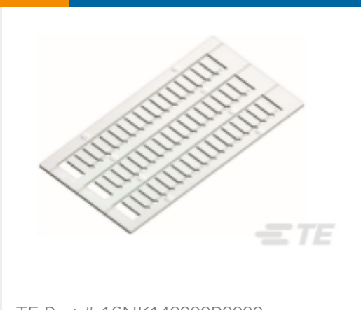
TE Part # 1SNK140000R0000 MC512