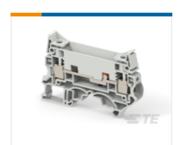
TE Part #1SNK508310R0000 ZS10-ST