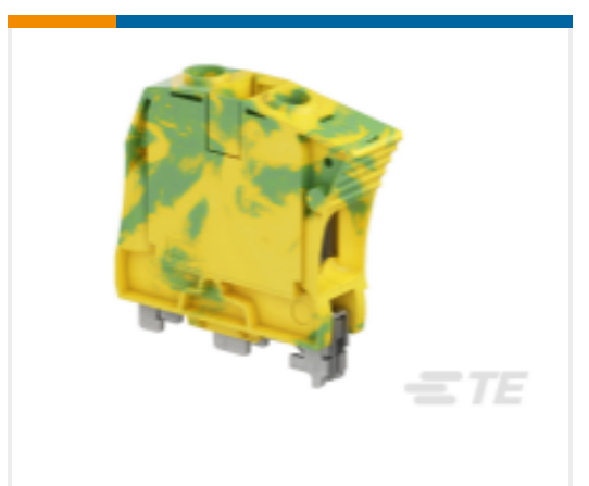
TE Part #1SNK516150R0000 ZS35-PE