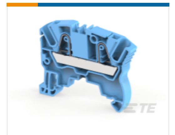
TE Part #1SNK706020R0000 ZK4-BL