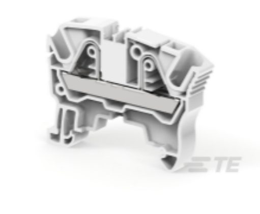
TE Part #1SNK708010R0000 ZK6