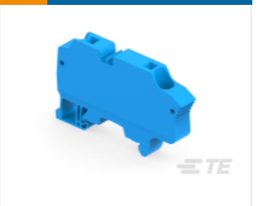
TE Part #1SNK710020R0000 ZK10-BL