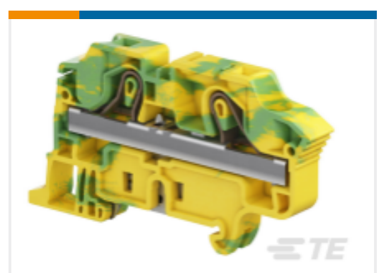
TE Part #1SNK710150R0000 ZK10-PE