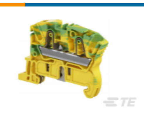
TE Part #1SNK706150R0000 ZK4-PE