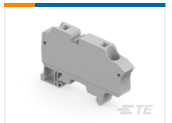
TE Part #1SNK710010R0000 ZK10