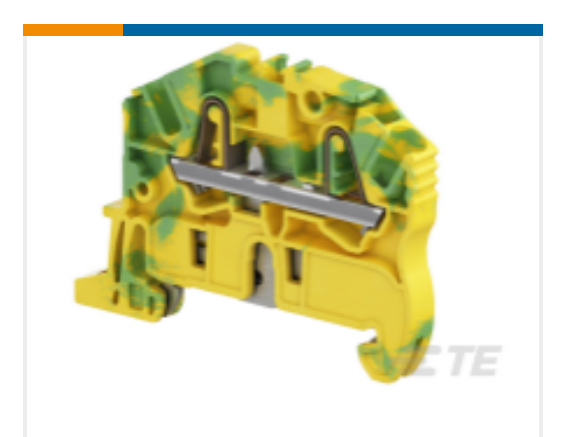
TE Part #1SNK705150R0000 ZK2.5-PE