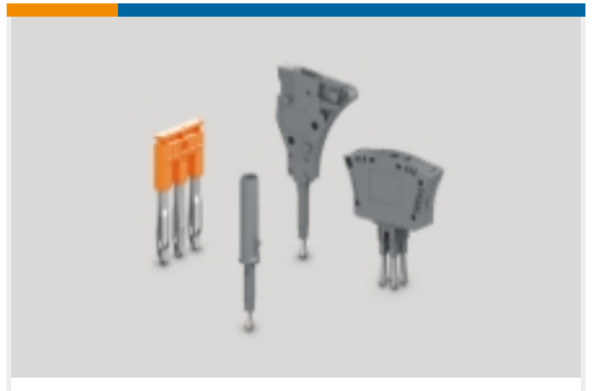
Terminal Block & Strip Conducting Accessories(67)