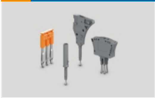
Terminal Block & Strip Conducting Accessories(67)