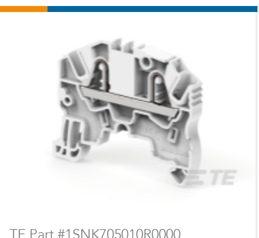
TE Part #1SNK705010R0000 ZK2.5