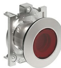
Illuminated button actuators, spring return - Flush LPFBL10