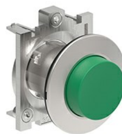
Push-push button actuators LPFQ20