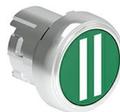
Pushbutton actuators, spring return, with symbol LPSB11