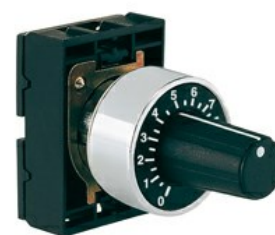
Potentiometer drives complete with mounting adapter - With graduate scale 8LM2TP100