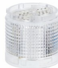
Signal tower Ø50mm/1.97" LTN50