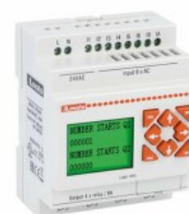
Start-up priority change relay. Modular version LVMP30 Priority change for 3-4 motors