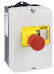
Surface mount enclosures IP65 (4X) for SM1P SM1Z Surface mount enclosures IP65 (4X) for SM1P SM1P...